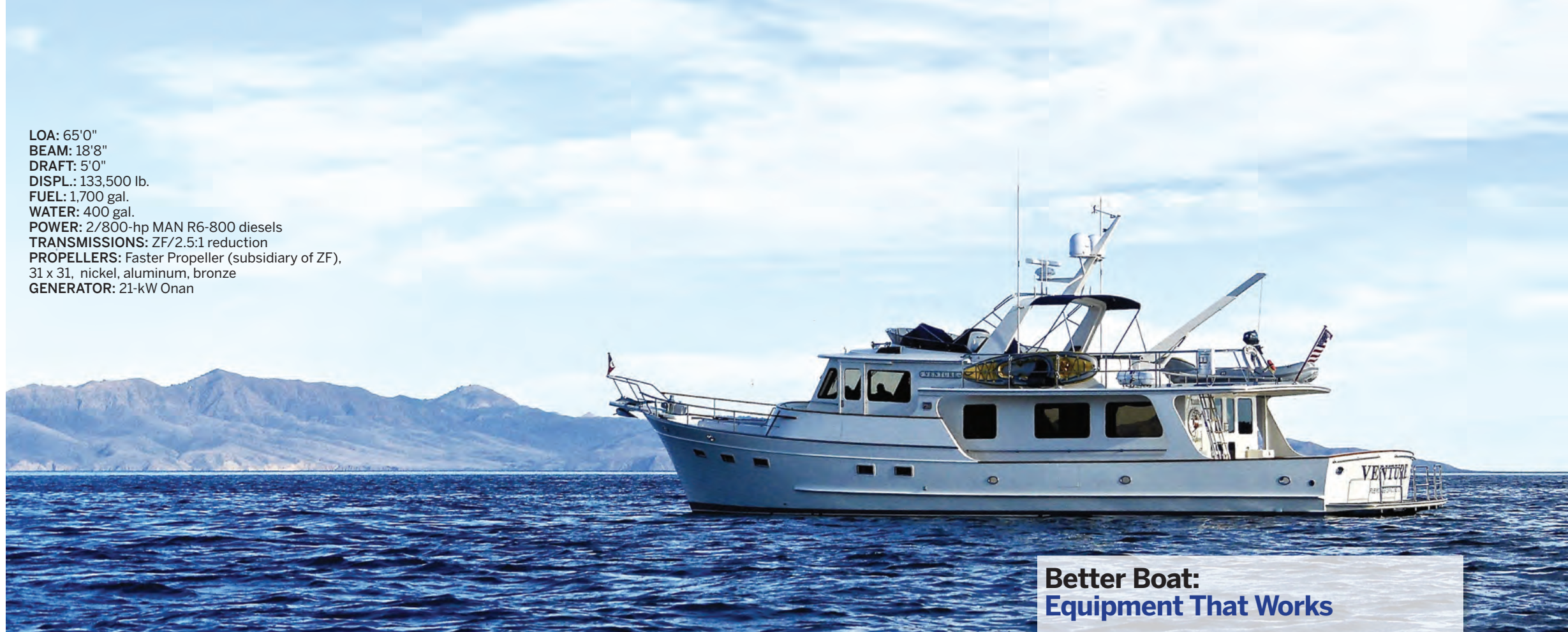
A California brown pelican searches for a meal (above, left). The 65's

After dawn, the thin, red track line on the Nobeltec cartography displayed a tangled zigzag where the Santa Ana had blown Venture back and forth, but the anchor had held. A few hours later however, with the wind still howling about 60 knots, it seemed that we were getting closer to the rocks off our port quarter. In the morning light, the beach in front of us had taken on an odd otherworldly golden