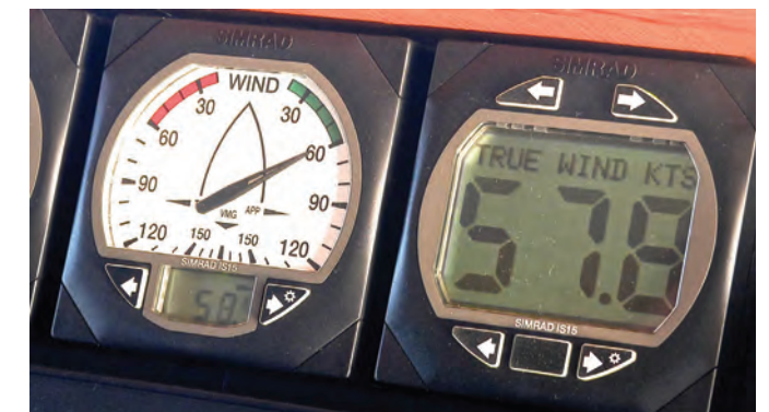
The arch at Anacapa is a popular site (left). Fleming mans the wheel as he's done so many times before (top). Just in case you didn't believe us, the author documented those powerful winds (above).

from Ventura), with Santa Cruz and Santa Rosa in between—have been part of a national park since 1980. Isolated, windswept, and dotted by sea caves, cliffs, a few beaches, and more than a few shipwrecks, the Channel Islands understandably don't have many inhabitants.